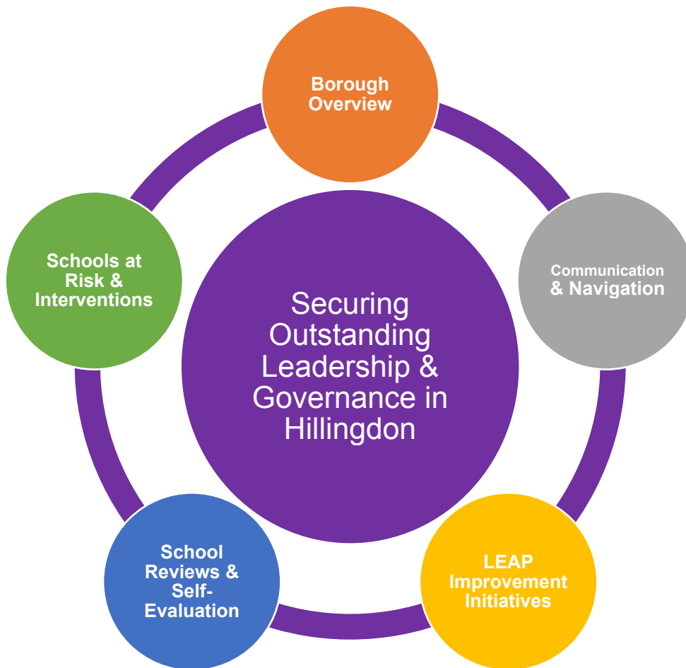
Figure 1 - Six Stands for Success Model

The shape of our strategy is captured in our 'Six Strands for Success', which we are committed to integrating and securing across the borough to ensure robust whole system improvement.